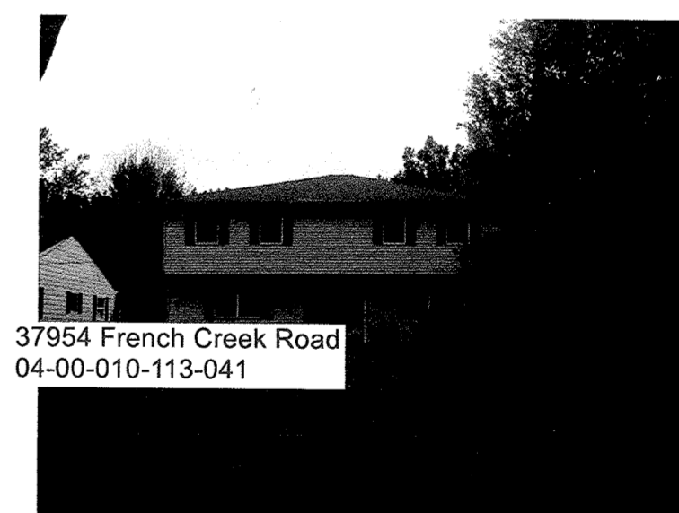
37954 French Creek Road 04-00-010-113-041