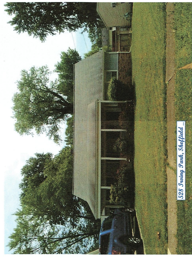
528 Truist Park, Sheffield