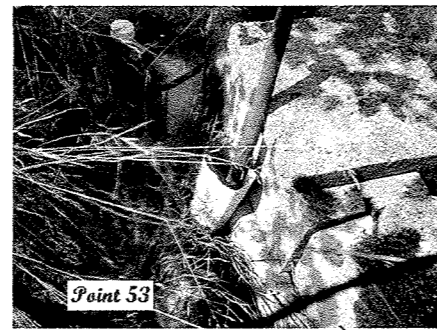
Note: Iron Pin Found in Downspout loose and not in the ground

Brandt Allotment Proposed Volume 00, Page 9