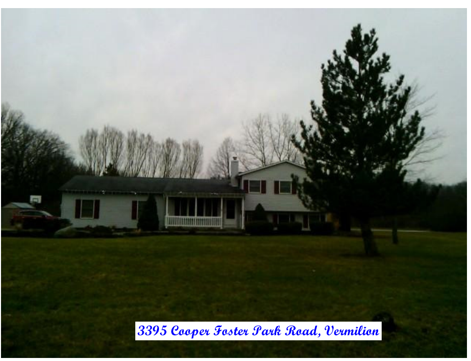
3395 Cooper Foster Park Road, Vermilion