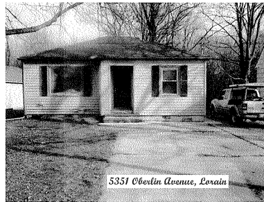
5351 Oberlin Avenue, Lorain

Note: Only copies signed with Red ink shall be considered Valid.