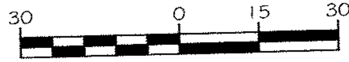
GRAPHIC SCALE (In Feet)

588°15'00"E FOR HIGH STREET AS RECORDED IN DEED NO. 2005-0079533