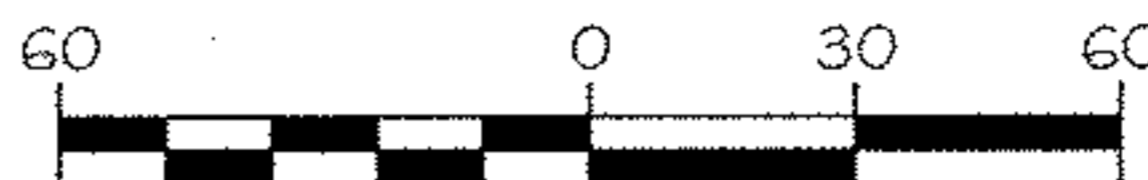
GRAPHIC SCALE (In Feet)

589°15'25"W FOR SNELL ROAD AS RECORDED IN DEED NO. 2007-0218633