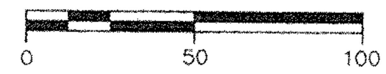
GRAPHIC SCALE ( IN FEET )

BASIS OF BEARINGS: WEST LINE OF SOUTH MAIN STREET ( S 01°17'30" E ) AS RECORDED IN DEED VOL. 1197, PG. 906