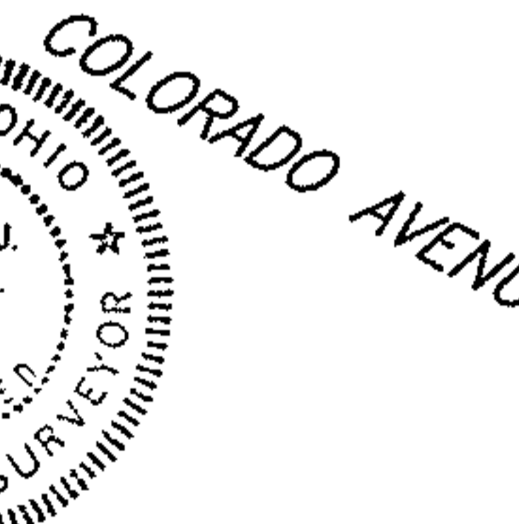
EXHIBIT TO LEGAL DESCRIPTION

State of Ohio Vol. 935 Pg. 12 4-00-003-102-016