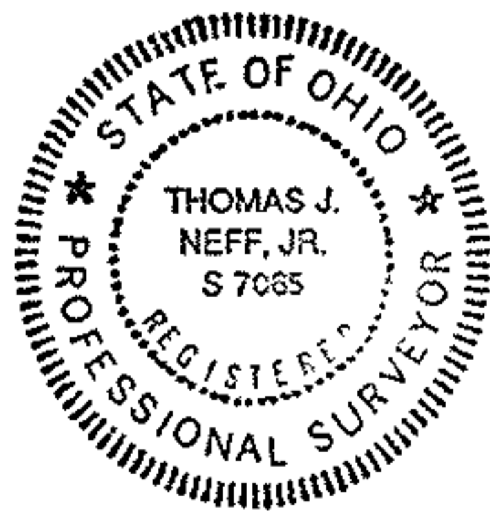
EXHIBIT TO LEGAL DESCRIPTION

COLORADO AVENUE (S.R. 611) VARIABLE WIDTH