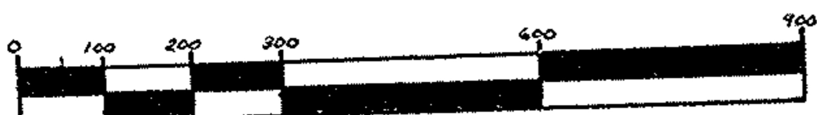
Scale In Feet

All bearings are magnetic and are to be used for the determination of angles only.