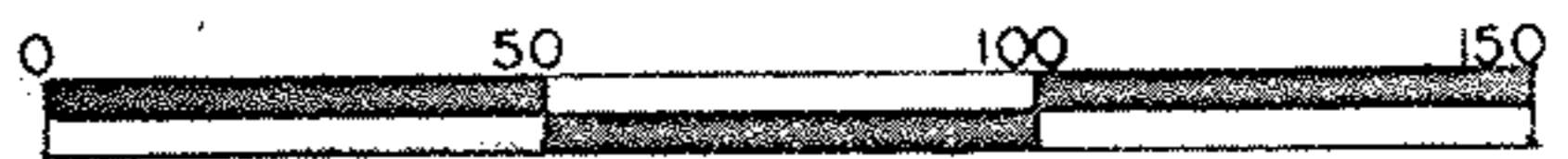
Scale in Inches

Note: bearings are based on an assumed datum