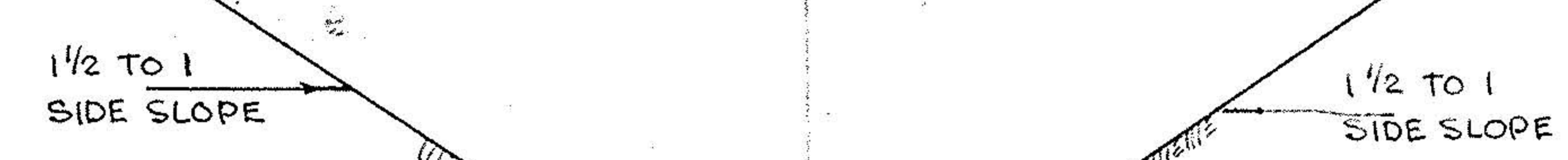
PROPOSED DITCH SECTION STA. 7+00 TO 20+80± SCALE: 1" = 2'

#15822 APPROVED LORAIN CO. MAP DEPT. DATE 10-1-84 PAGE 12-E BY T.M. Hall 2010