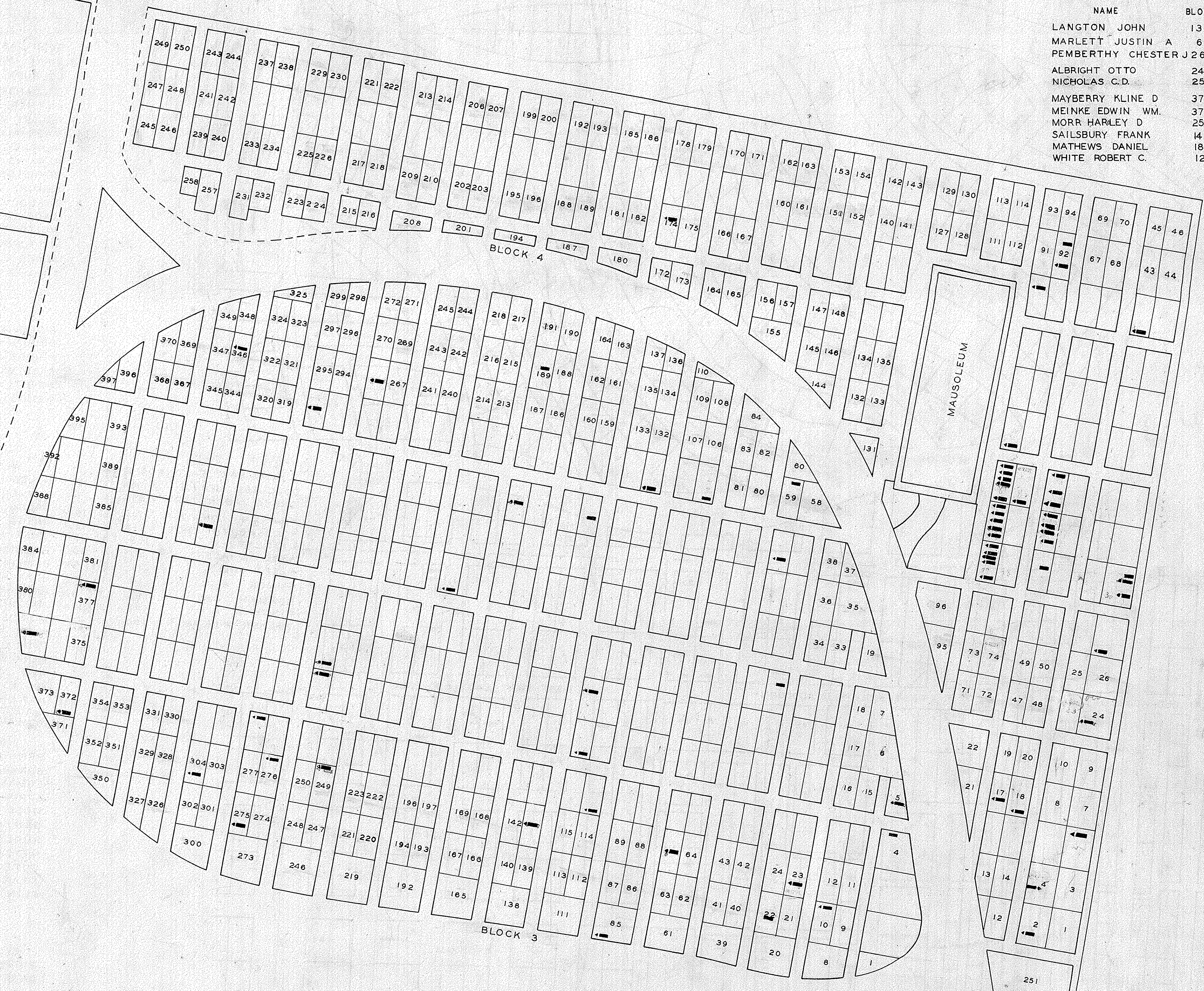
BLOCKS 3 & 4 SCALE 1"=20'