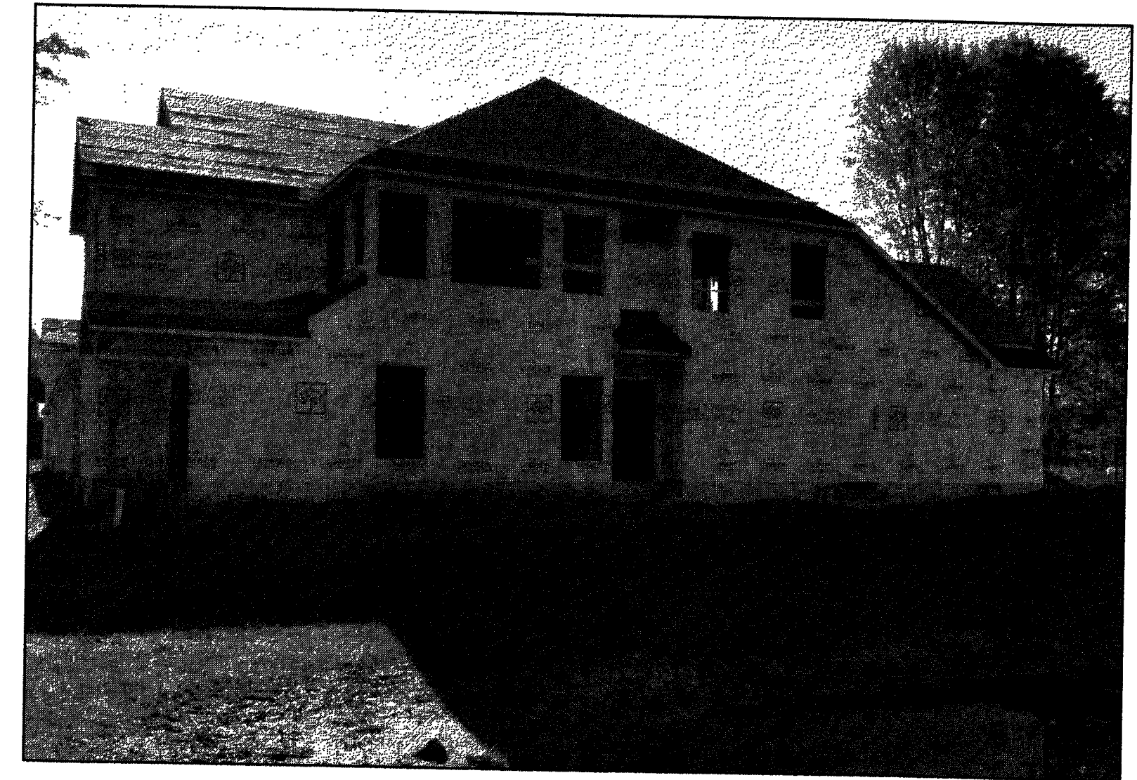
UNIT 7 SIDE