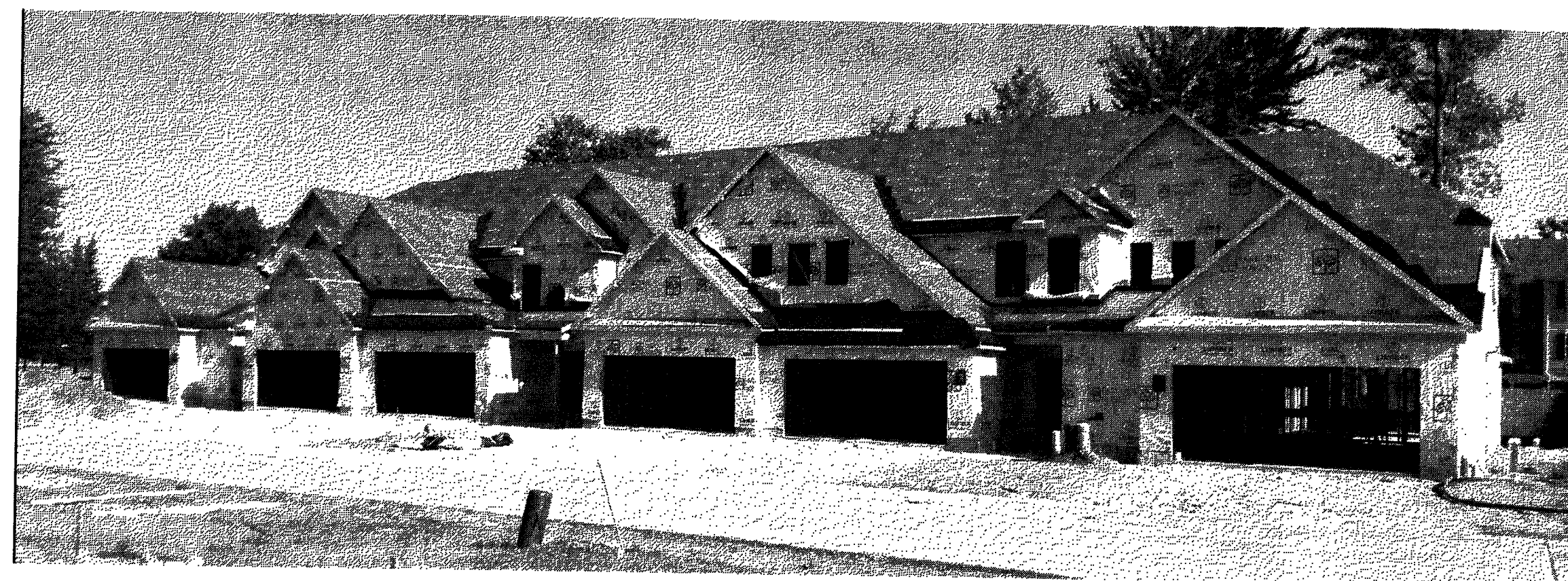
UNITS 7-12 FRONT