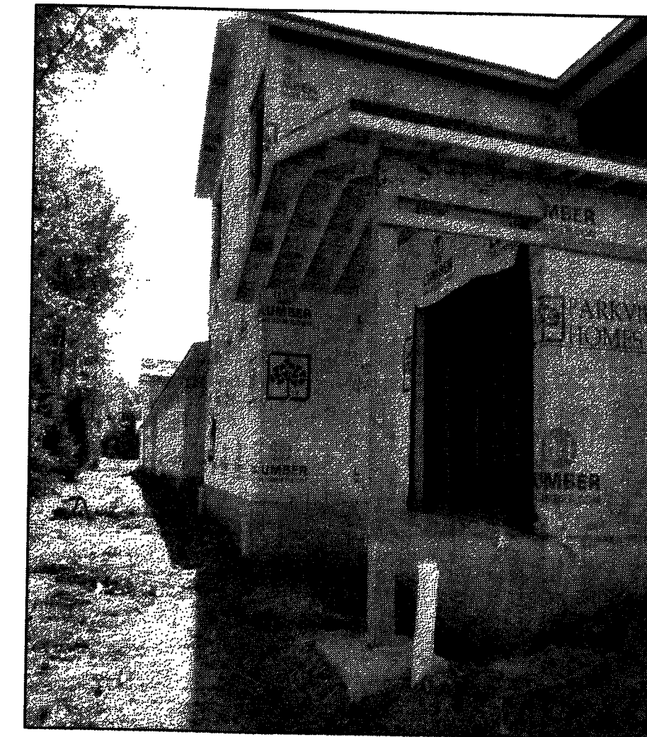
UNITS 7-9 REAR