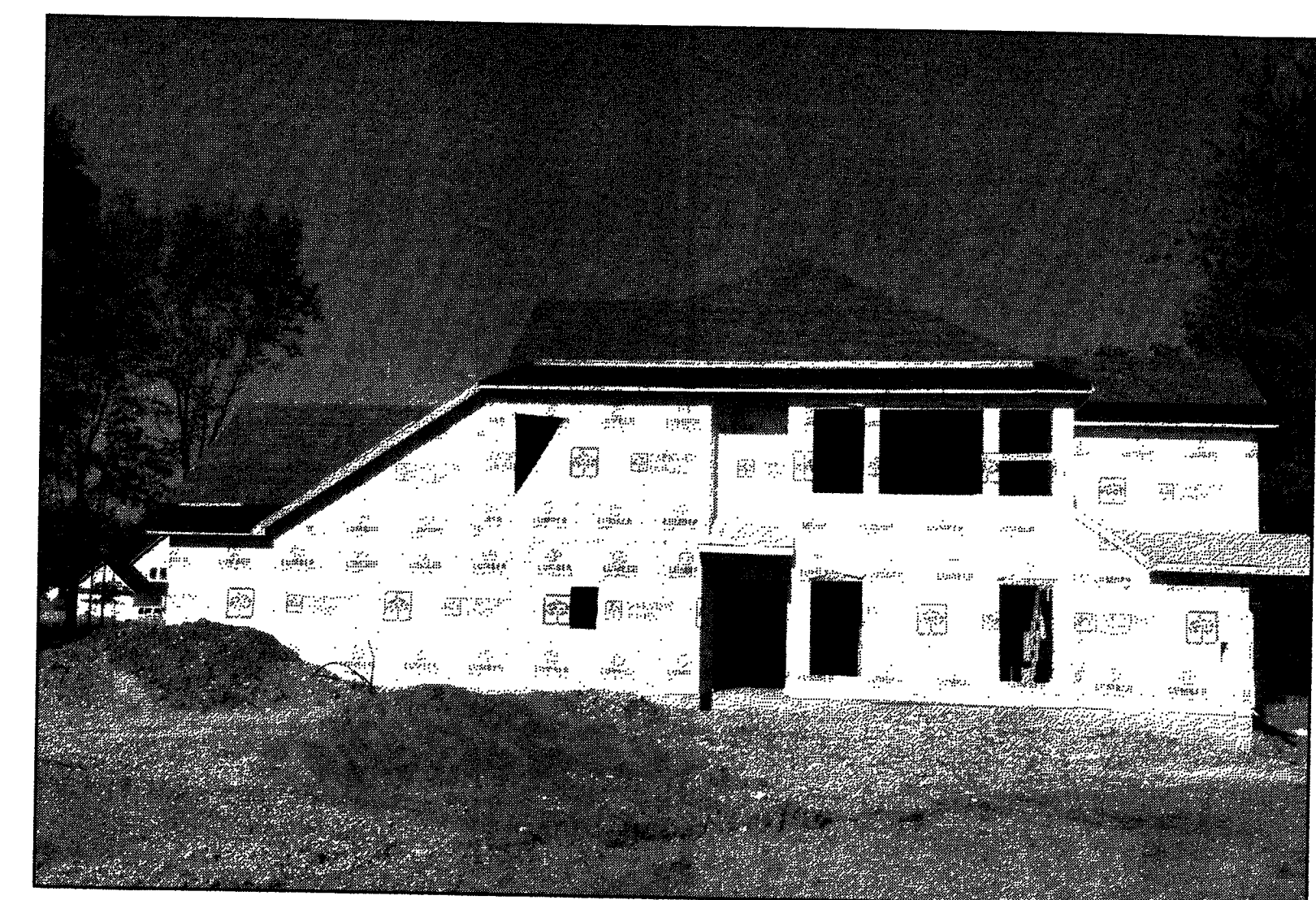
UNIT 12 SIDE