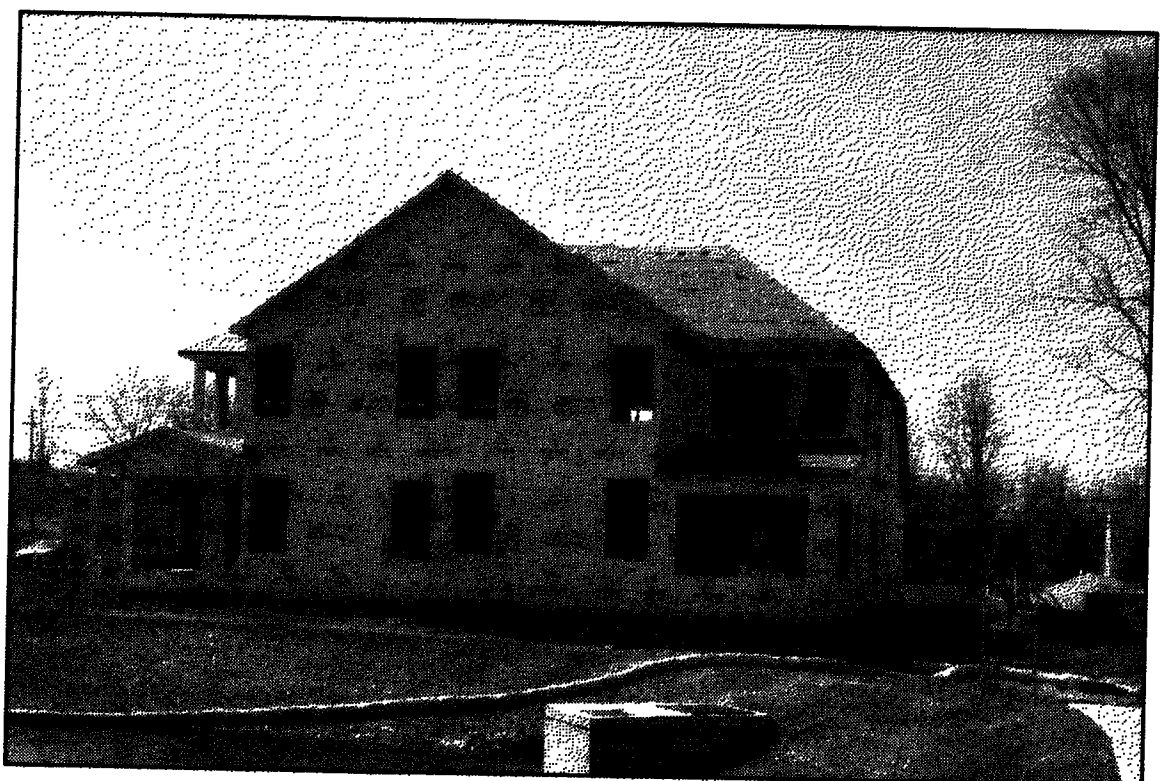
UNIT C-1 & C-2 REAR

7' ELECTRIC LINE EASEMENT TO C.E.I. INSTR. #20200762952