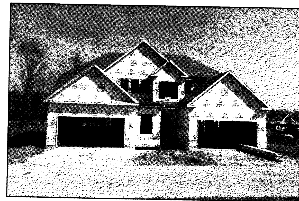
UNIT C-1 & C-2 FRONT

N BASED ON LEAR ROAD BEARING N00°01'30"E