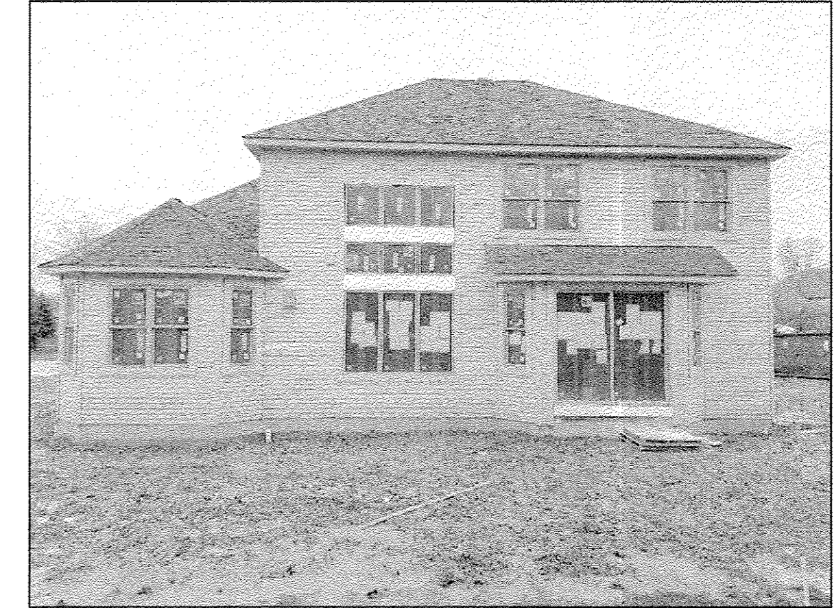
UNIT 30 REAR