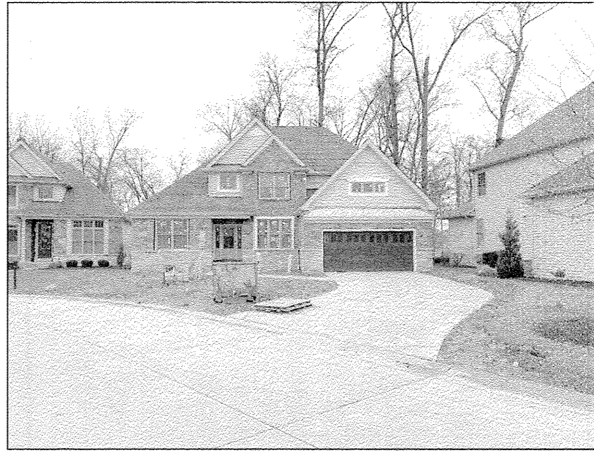
UNIT 29 FRONT