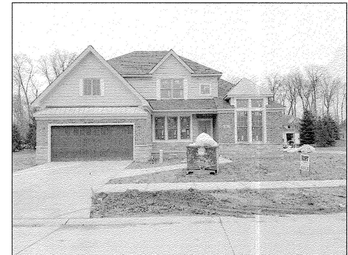
UNIT 30 FRONT