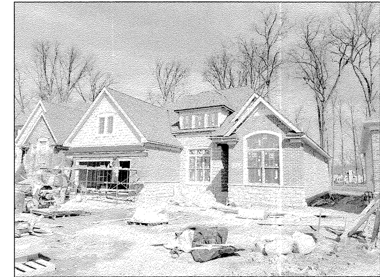
UNIT 26 FRONT