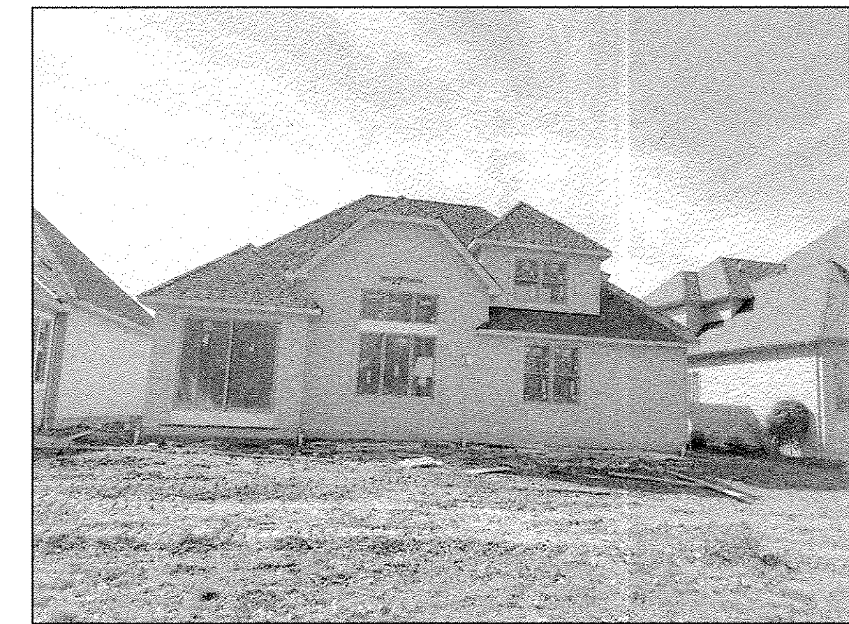
UNIT 26 REAR