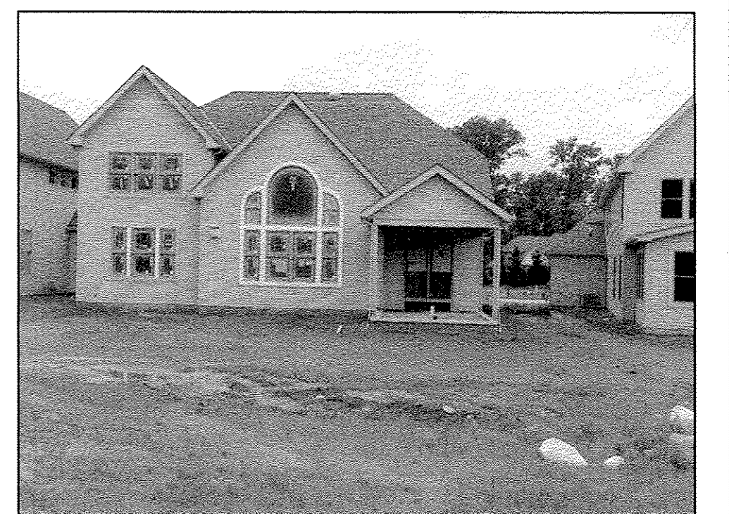
UNIT 15 REAR

NOTE: LIMITED COMMON ELEMENTS INCLUDE THE LAND WITHIN 3 FEET FROM THE FOUNDATION AND PATIOS/DECKS/ PORCHES/SUNROOMS OF EACH UNIT, AND LAND 12 FEET OFF OF MAIN REAR WALL FOR CONSTRUCTION OF A DECK OR PATIO