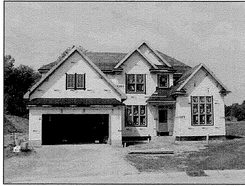
UNIT 16 FRONT