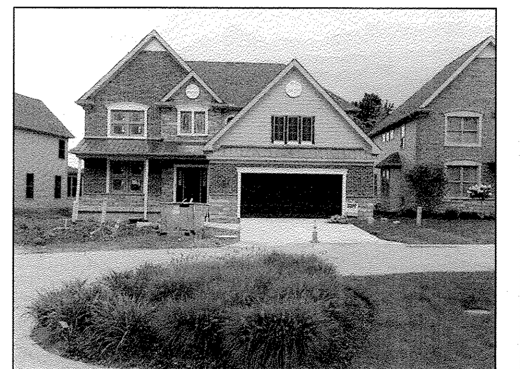
UNIT 15 FRONT