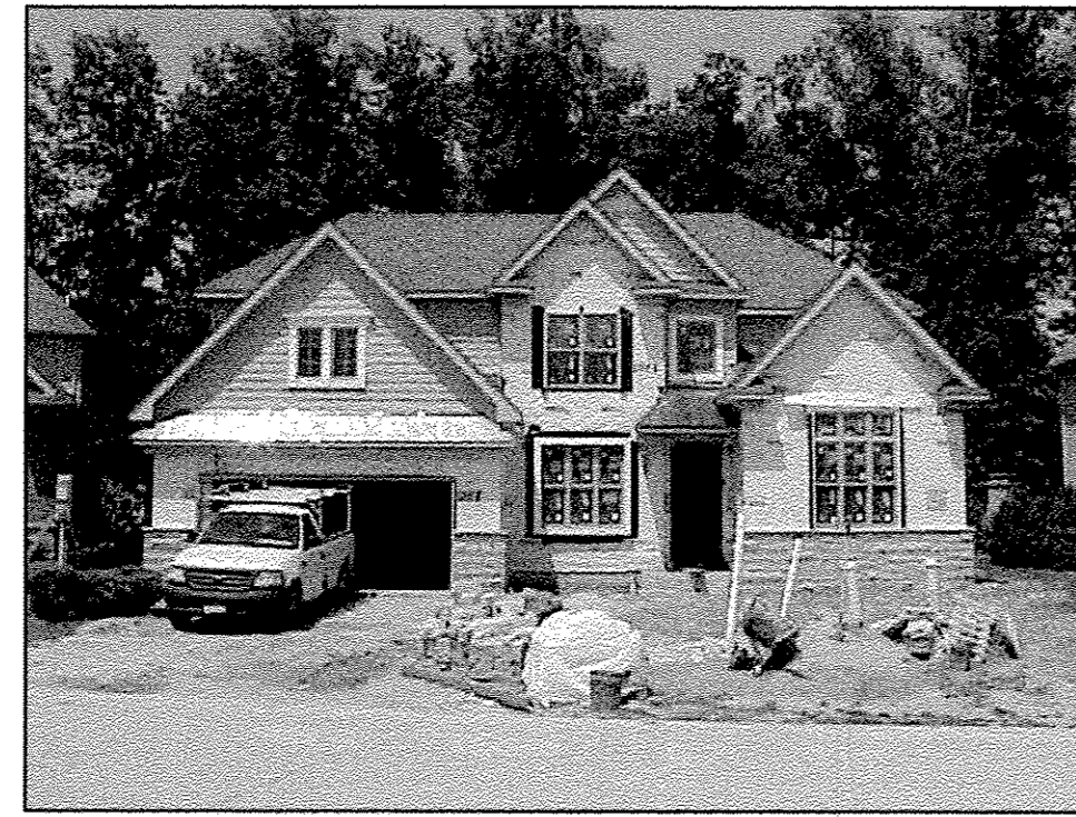
UNIT 17 FRONT