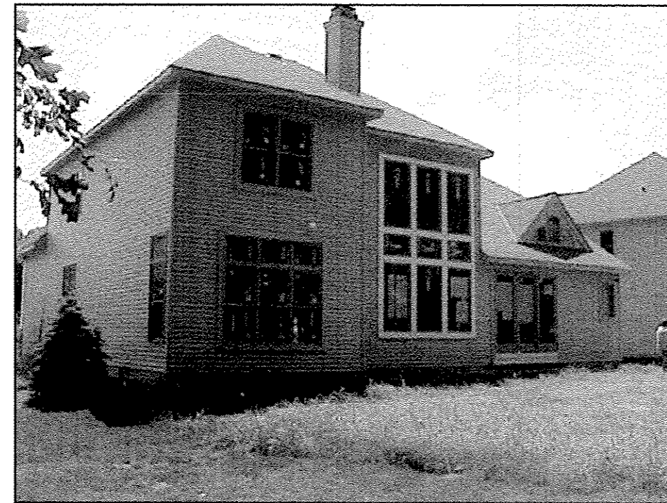
UNIT 17 REAR